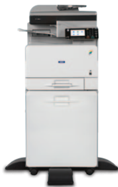
MP C305 with one bin tray

Some features may require additional options.