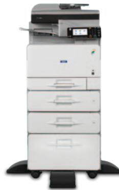
MP C305 with two optional PB1050 Paper Trays